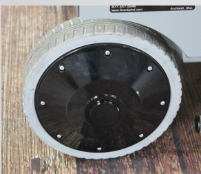
Auto locking brake prevents unit from rolling away, even on inclines.