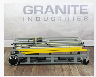
Unit folds down and will fit into the back of a standard pickup truck for easy transport.