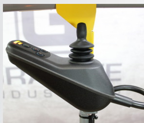
Joystick controller is simple to operate.